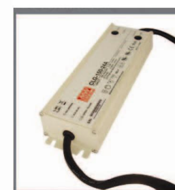
alimentation étanche 230Vac/24Vdc - 150W IP67