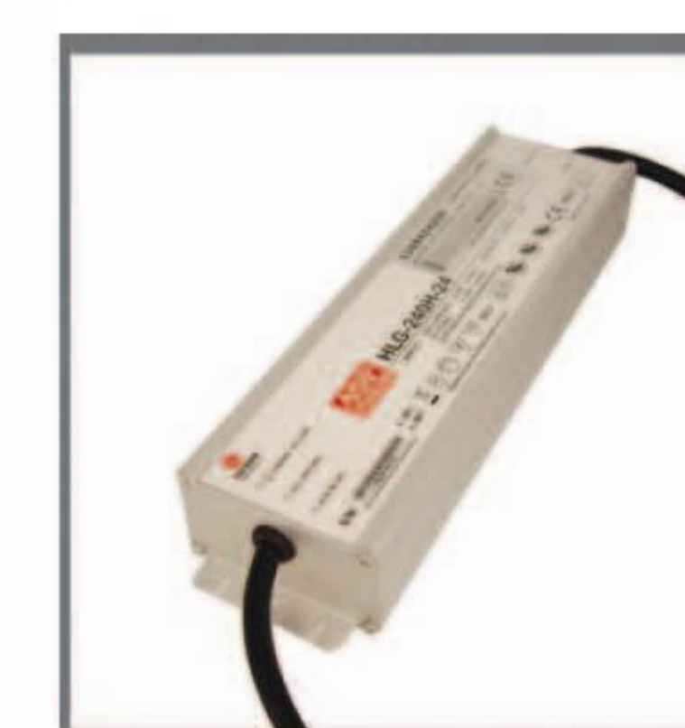
alimentation étanche 230Vac/24Vdc - 240W IP67